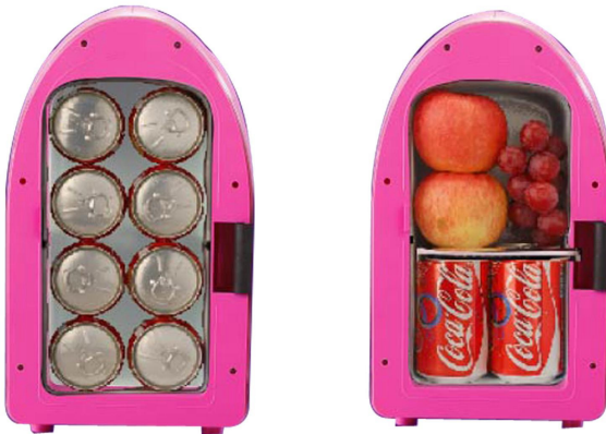
6 Litre capacity, but still small enough to be portable